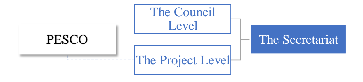
Figure 1 PESCO chart based on the PESCO Factsheet (European External Action Service, 2018a).

PESCO's governance rules are described in the Council Decision establishing PESCO and determining the list of participating Member States (Council of the European Union, 2015). PESCO has a Council level, and a project level. Specified by Article 4(2) (b) in the 'PESCO Governance' of the Council decision of establishing PESCO and the list of pMS, the Council should adopt decisions and recommendations on sequencing the 20 binding commitments for the two phases of 2018-2020 and 2021-2025 (Council of the European Union, 2017); (Council of the European Union, 2018b). The Council will also ensure the unity, consistency and effectiveness of PESCO, the same as the HR/VP are obliged to by Article 6 (1) in Decision (CFSP) 2017/2315 (Council of the European Union, 2017). Furthermore the HR/VP will be involved in proceedings relating to PESCO according to Protocol No. 10, specified as the 'importance' of the positions full involvement (European Union, 2008).