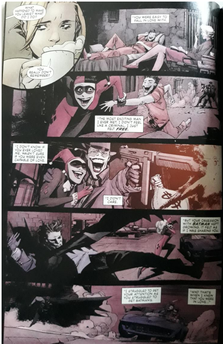
Figure 10. from White Knight 106