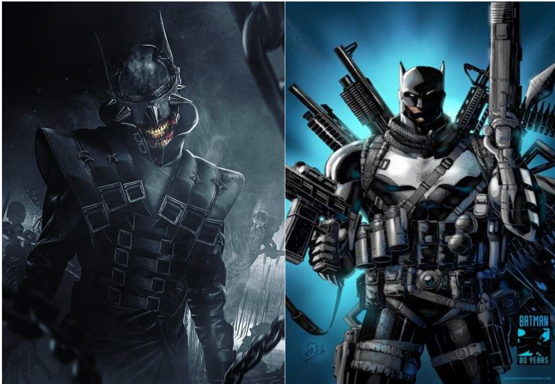
Figure 3. The Batman Who Laughs 80 & The Grim Knight 81

Above in Figure 3. we see a the recently created characters The Batman Who Laughs (left) and The Grim Knight (right). The Batman Who Laughs originates from a place called the Dark Multiverse, making him able to see people’s dark urges and fears. However, he needs to wear a visor out of “Dark Metal” (like the one he is wearing in Figure 3.), in order to focus his senses and pinpoint what he is searching for. Another of his notably visual features is his grin, which resembles to that of the Joker. The grin contrasts tremendously to the Batman from our universe and The Grim Knight who rarely laugh or smile. As we can see to the right on Figure 3. The Grim Knight looks exactly like the Batman from our universe, except that he is strapped to the extreme with deadly weapons, which Batman has a strong policy against. In regarding to doppelgänger motif, one could debate whether or not both The Grim Knight and The Batman Who Laughs could be considered Bruce’s monster doubles. In this case I would disagree with the first and partially disagree with the second. The Grim Knight is an alternate version of Batman that uses both guns and kills people, making him not necessarily a villain nor a hero, but on the boarder of anti-hero and villain depending on your point of view.