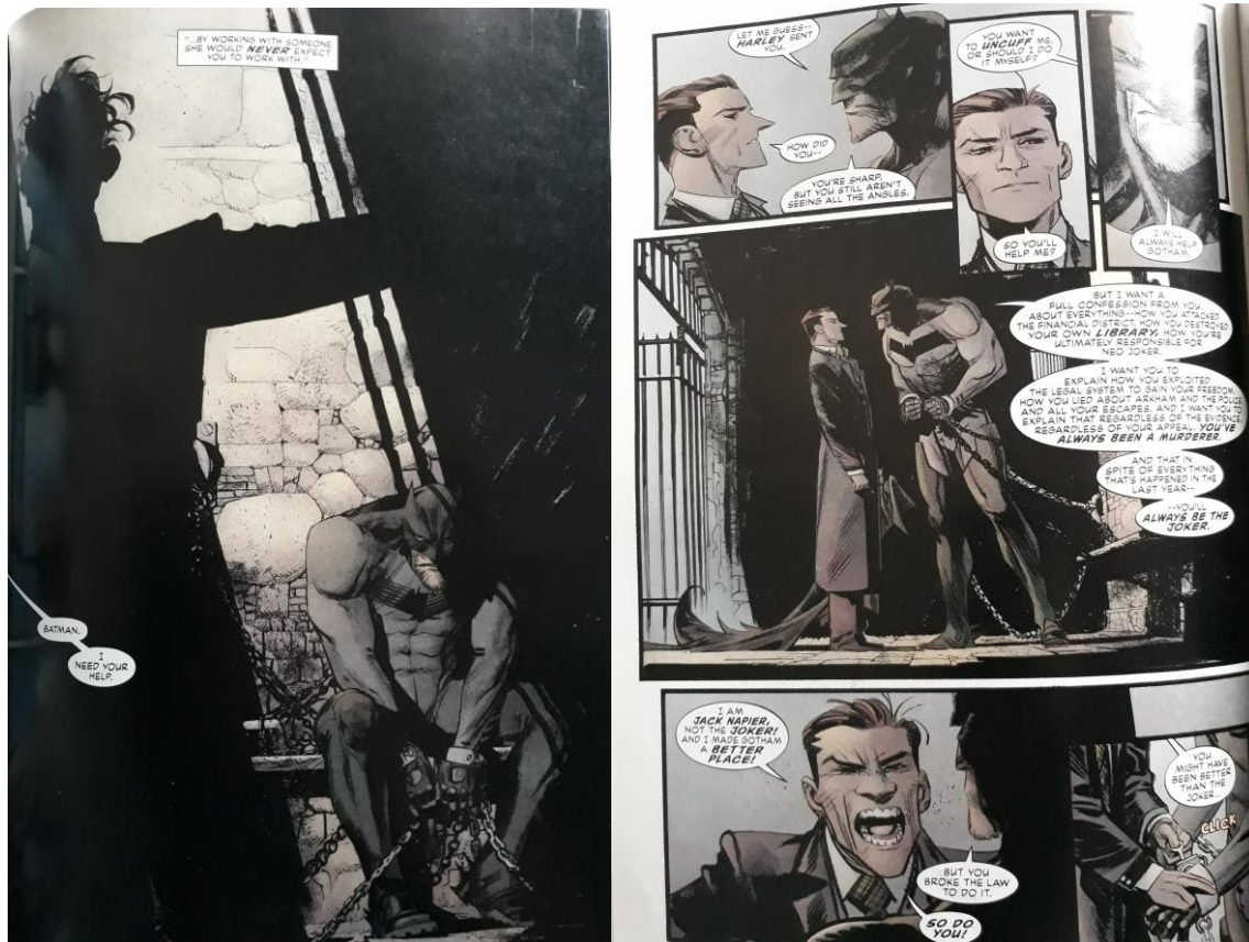
Figure 13. from White Knight 111

In Figure 12. we see that the medication has changed the Joker physically as well as mentally. Nonetheless, artist/writer Sean Murphy has on several occasions in this graphic novel drawn Jack Napier’s actual shadow in the shape of the Joker. Two examples are in Figure 12. and 13. above. Figure 12. depicts Jack Napier in court, while Figure 13. depicts a shadow shaped like the Joker before Jack Napier enters Batman’s cell to ask him for help. The shadow also seems to have grown significantly from Figure 12. that depicts a scene early in the comic book, and Figure 13. that depicts a scene further along. The illustration of difference in size between Figure 12. and Figure 13. may indicate that Jack Napier is struggling with containing the Joker within him, and that the medication is failing him.