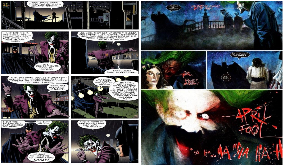
Figure 4. from The Killing Joke 86 and Figure 5. from Arkham Asylum 87

The major differences are also to be found in the artwork done by Brian Bolland in The Killing Joke and Dave McKean in Arkham Asylum . Whilst the illustrations in The Killing Joke are realistic, clearly and habitually divided into separate panels, the illustrations in Arkham Asylum are very abstract with varying “gutters” (spaces between the panels) and sometimes none at all. This could be explained through the name and content itself. In The Killing Joke the Joker is trying to make a point, and in order to make a point one has to make an argument that has to be set up logically and in a specific, clear order. This applies to a joke as well, which in addition needs timing. By structuring the panels and the spaces between as they do, Moore and Bolland are able to illustrate clearly what the text intends to say. In Arkham Asylum there is the opposite. There is no point and no argument, thus no need for structure or order. There is merely Batman being tested in a maze in a madhouse trying to discover something he may or may not like.