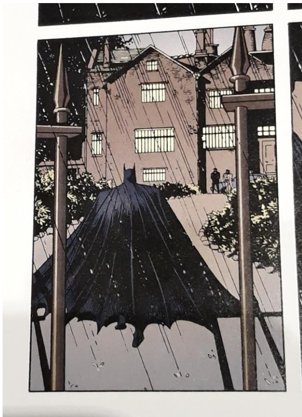
Figure 6. from The Killing Joke 89

The short part at the very beginning in The Killing Joke , where Batman goes to Arkham Asylum to plead with the Joker, is also portrayed very differently compared to his entrance in Arkham Asylum . Indeed, both seem to captivate the general mood of Batman's psyche.