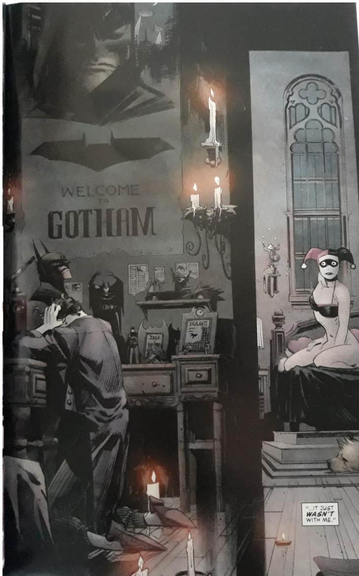
Figure 11. from White Knight 107

Figure 10. and 11. depict the course of the Joker and Harley Quinn's relationship in a few segments. The first panel in Figure 10. captures the time she treated him in Arkham Asylum and fell in love with him. The second and third panels illustrate their carefree criminal career and the fourth and fifth show the Joker's growing obsession with Batman. The story ends with Figure 11. where Harley Quinn is in her underwear waiting for him, and the Joker is in significant emotional duress surrounded by Batman artifacts. However, despite leaving the Joker years prior, she still proves that she is in love with him by having created the medication that made him "sane" and help him take over Gotham.