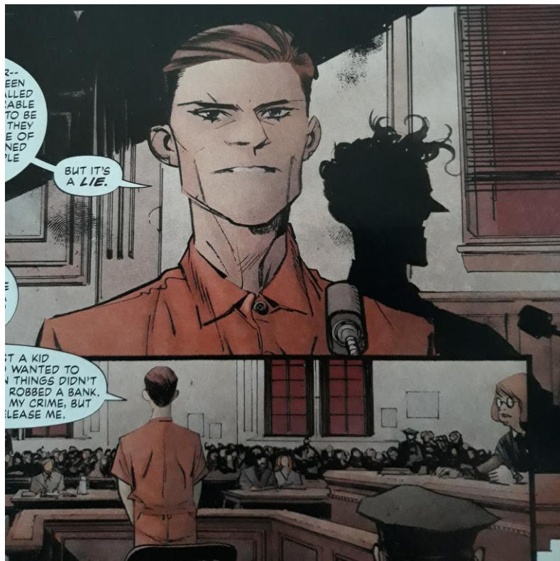
Figure 12. from White Knight 110

According to Jung one tends to reject or remain ignorant of the least desirable aspects of one's personality, but these could also be generally positive things. Thus, it would be understandable for the Joker to push any positive and moral thing into his unconsciousness, to the point that he may not even be aware of them. So, whenever he changes personalities his shadow could potentially be a constant invisible companion.