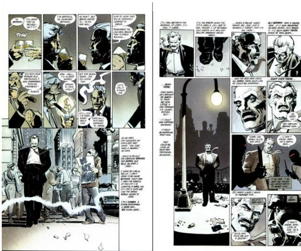
Figure 2. from The Dark Knight Returns 72

In Figure 2, like in the quote we can see that the older Bruce Wayne feels separated from the crowd, especially being the only one dressed in black. On the right side of the image we can see that as he arrives at the spot where his parents were murdered, he looks up for the first time after leaving James Gordon. Under the iconic streetlight that has been depicted so many times he is looking at the light, as if looking for hope or some light in the otherwise black and grey Gotham. What is interesting here is that he has no actual shadow cast from the streetlight, and his black jacket has now lighted up while his pants are still black. One interpretation can be that there is no shadow because there is no more Batman. Another could be that his shadow has merged more with his human side, which could explain his bitterness. A more artistic interpretation is that his pants are blacker because he feels Batman snarling in him from his toes to his gut. Either way this scene strongly implies that Batman is a