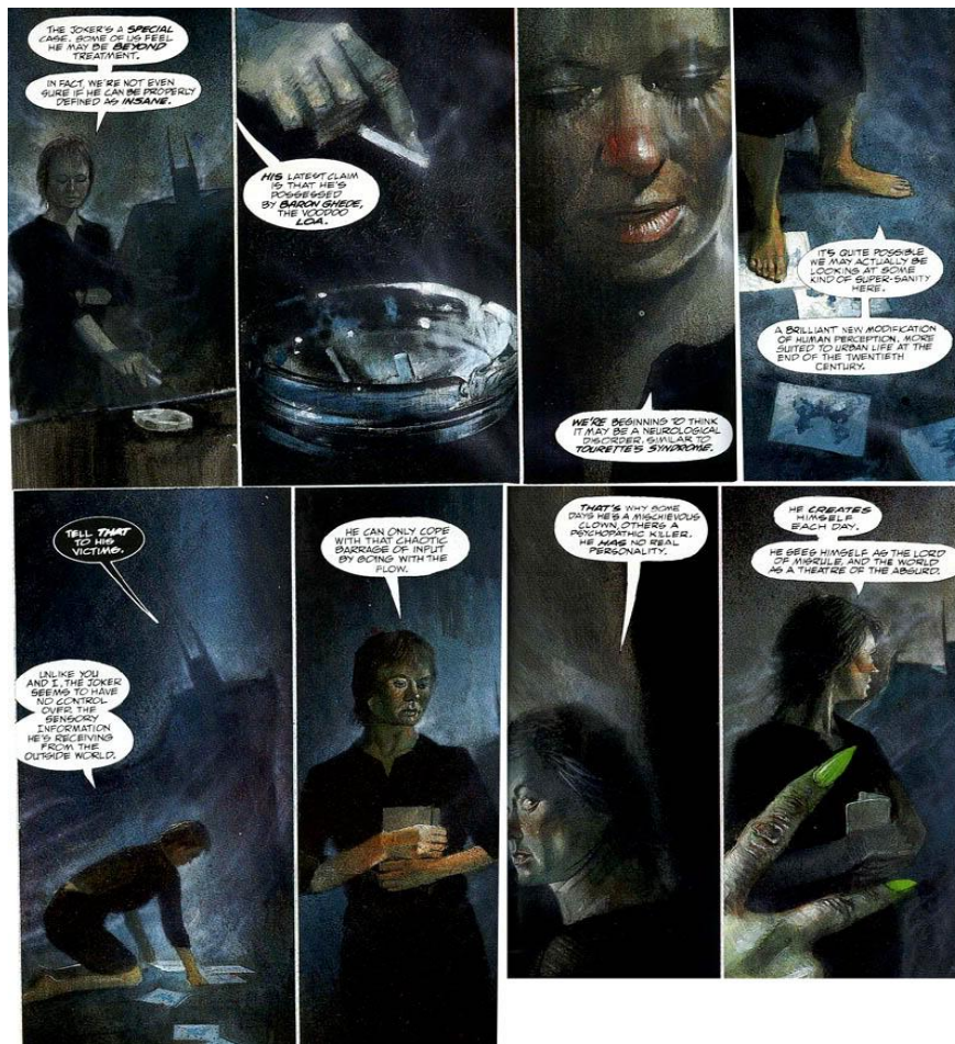
Figure 8. from Arkham Asylum 93

According to Dr. Adams the Joker might not be insane at all but instead suffers from a neurological disorder which she only labels as “some kind of super-sanity” 94 . She tells Batman: