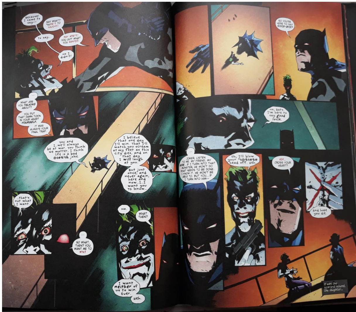
Figure 9. from The Batman Who Laughs 102

Joker avoids being killed by The Batman Who Laughs, Batman lets him in his Bat Cave. The Joker then shoots himself in the heart so that Batman would be infected with joker toxins and become The Batman Who Laughs. He does this out of belief that Batman has to become like his foe in order to defeat him. Despite sacrificing himself, the Joker survives thanks to Alfred's surgical skills. Another example is around midway during the graphic novel, as Batman is testing a water reservoir for poison, and the Joker (who is now awake) comes to talk.