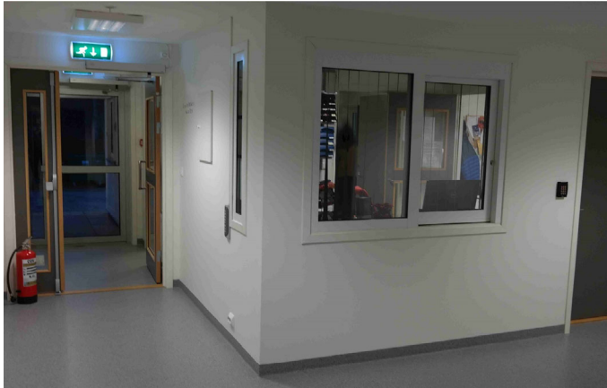
Figure 3 A staff room viewed from inside a supported housing

In many places, the staff rooms had huge windows and glass-panel doors which helped the tenants identify when a staff member was available if they needed assistance. The tenants disliked staff rooms constructed without such built-in visibility. This example of staff room visibility indicated differences in materialities which were additionally grounded in the way in which managers organised their housing sites. In some accommodations, no medicine room or cabinet was available; medicine was instead distributed by community nurses, and therapy was performed by assertive community treatment teams. However, many staff rooms were reminiscent of institutional settings, expressing a hospital ‘ward atmosphere’ (Martin et al. 2019) instead of a domestic one.