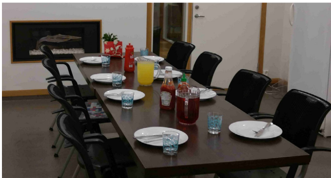
Figure 4 A dining room

Despite the benefits of being served food, one tenant criticised the practice: 'Nobody is explaining how to do it. We rather need training in household and cooking in the apartment. It is important to be seen under normal circumstances. It is not OK that people get positive