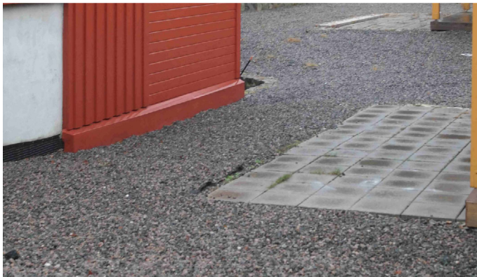
Figure 2 Moon landscape in the garden

The staff rooms were mainly associated with materialities that narrow the understandings of tenants as dangerous persons in need of care and control. Control was already signalled by two different entrances to the supported housing, one of which was accessible only to staff. For example, at Riverside housing, an employee explained that the staff-only entrance was built as an emergency exit after a violent incident occurred with a tenant, and that a thick window made of tempered glass had been installed. Another aspect concerned the material qualities of the staff room, which resembled a cross between a business office and a nursery room that could serve for administrative work and for medicine preparations (Figure 3).