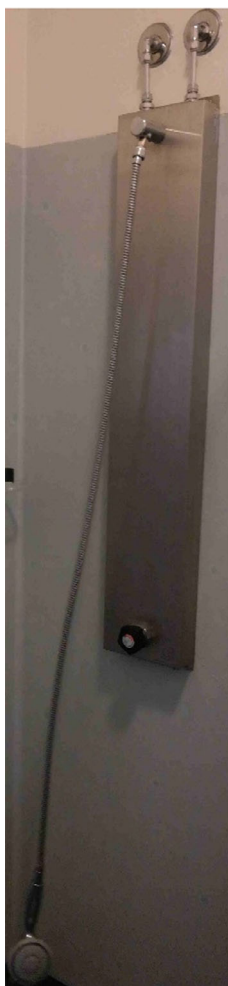
Figure 5 A robust steel shower

soundproof walls, even though the tenants often felt annoyed by noise. While one manager explained that the low standards were because ‘Some tenants are in such bad condition that they cannot take care of their own hygiene or their apartment’, another manager acknowledged that a design with minimum standards ‘reduced the living quality for the tenants’.