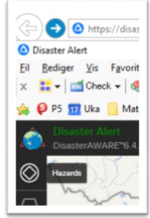
Image text options. Each image should have an appropriate alternative text. There are not many images in these pages, but the main parts of the pages are graphical maps which are not accessible by screenreader. There are some image buttons, but they have no alternative text and are not coded as buttons ( Fig. 3 ). The play-icon is a button and its alternative text contains the word "icon" which is unnecessary information.

Page title. The title of the application window is sufficient and briefly describes the content of the page. Both sites have well-formed page titles, but none of them reflect the last search which was done. Showing the search terms in the title could be useful to distinguish multiple simultaneous instances of the map.