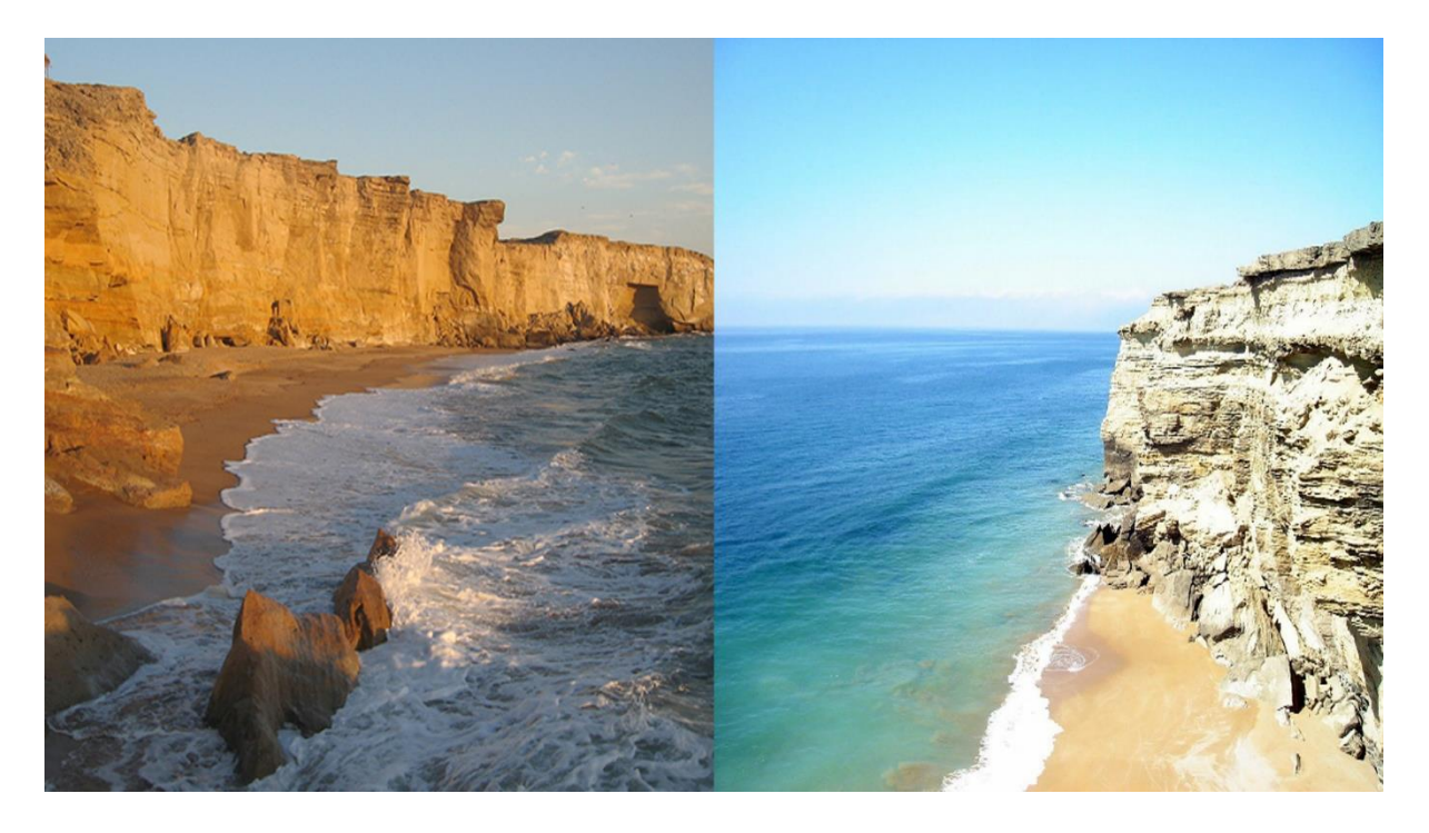
Figure 10: Two beautiful views of virgin beaches in Gwadar. Source -Youlinmagzine (left), Astola Island (right)

There antique handmade boats can be used to sail tourist and they work as drivers, tourist guides and in other tourism related businesses such as hotels and resorts. Pak-Iran boarder in "Kech" (near Gwadar) also has a potential to increase tourism in Gwadar. Around millions of