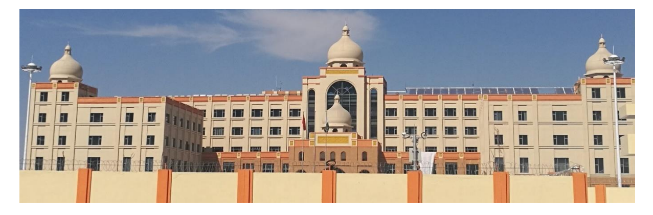
Figure 8 : Gwadar Free Zone

To achieve the modern society through development, there are several risks involve, mentioned by Ulrich Beck in risk society theory. The study analysed the situation and investigated the fisherfolk of Gwadar to find out the risks involved. The study established that fisherfolk of Gwadar are struggling and their life is getting miserable every other day due to risk associated with CPEC developments. The livelihood of fisherfolk of Gwadar is at higher risk. Since 2006,