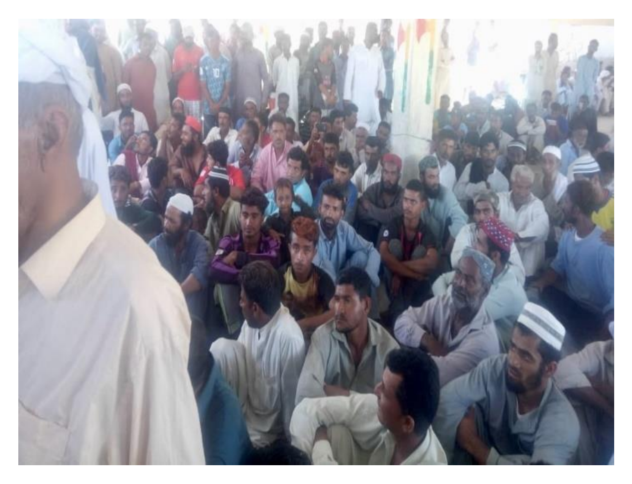
Figure 6: The fisherfolk of Gwadar are sitting in protest against forced evictions without any prior notice.

A fisherman protestor says, "we were not informed about any alternative route to access the sea. How we will access to sea and earn livelihood to feed our families?"