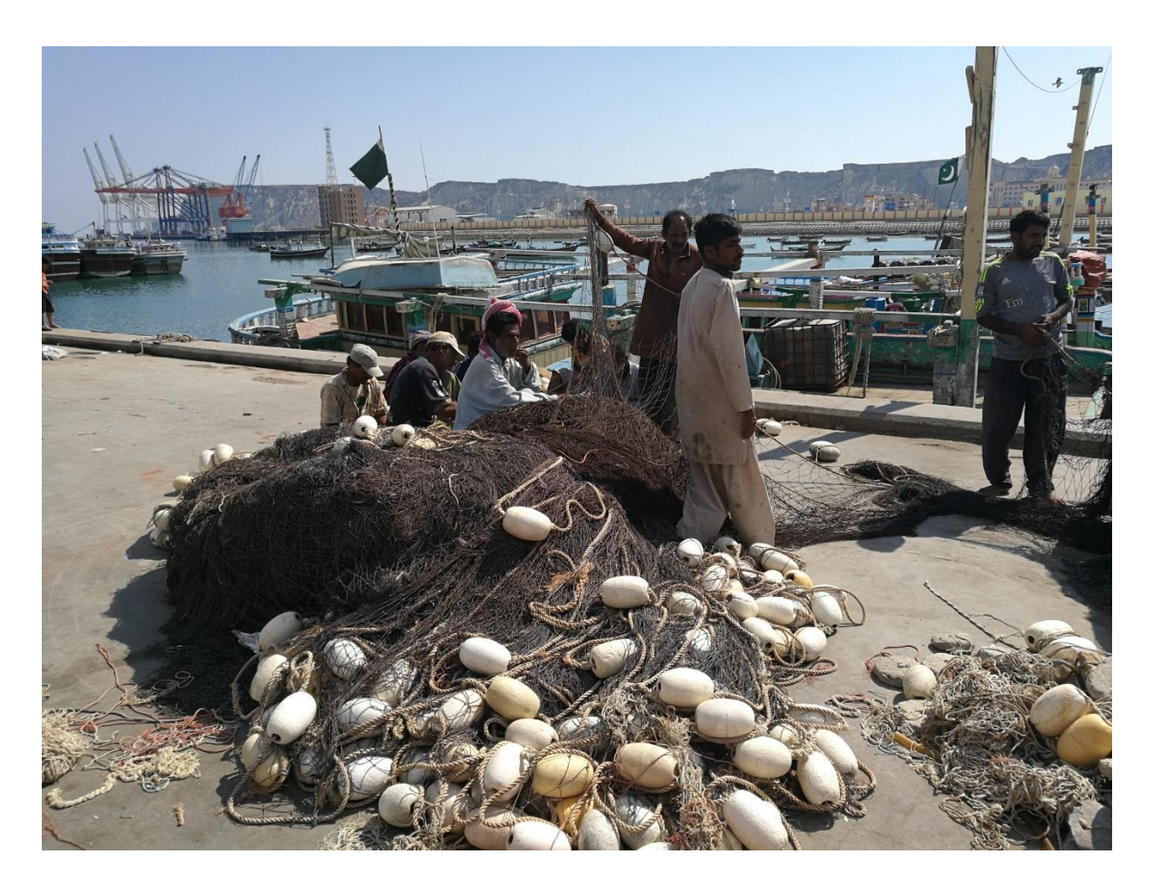
Figure 2: The fishermen sitting at harbour fixing their fishing nets. New Gwadar port can be seen in the background.

Regarding local business in Gwadar, it has been observed during the course of field study that there two main types of local businesses sea-food factories and boat making workshops, providing livelihood to number of people in Gwadar. Other local small businesses are restaurants, general stores and oil depots. The people associated with local businesses and their workers also participated in the interviews. The responses gathered were