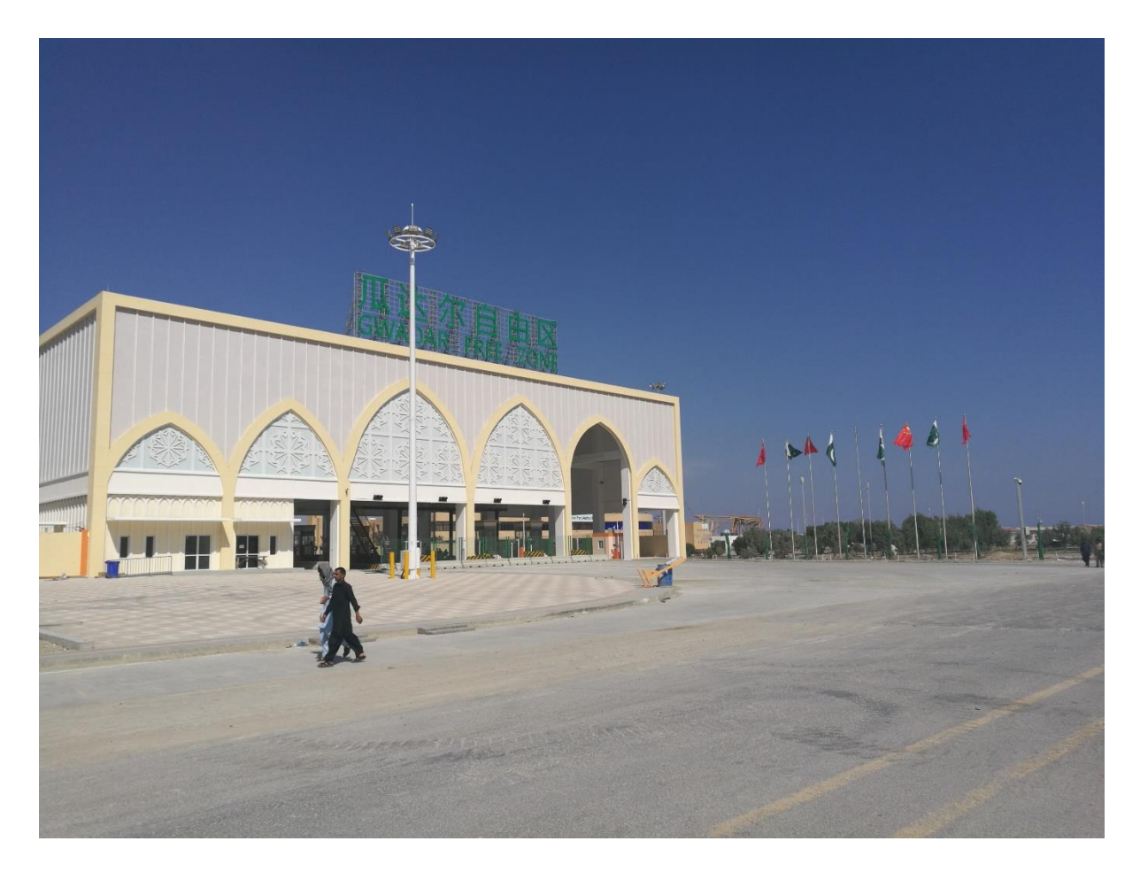
Figure 7 : Gwadar Free Zone Entrance