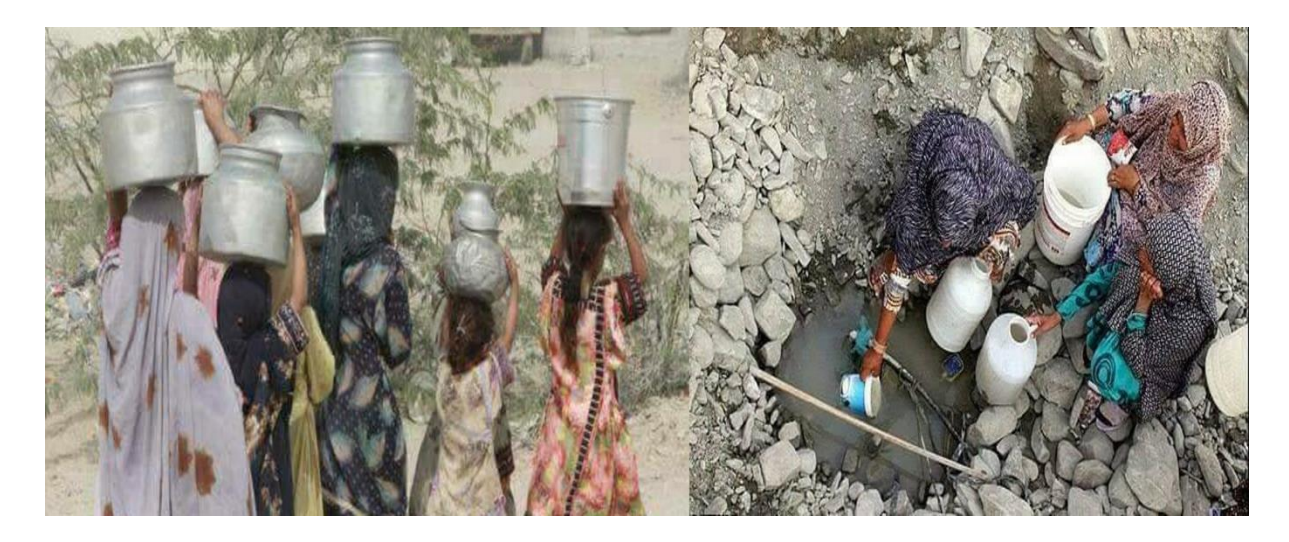
Figure 3: Shows the water scarcity in Gwadar. The women (at right side) are filling the water pots while the young girls (at the left side) are transporting water to their homes.

One respondent mentioned that "The one and only source of water in Gwadar 'Ankara Kaur Dam' has been dried because of no rainfall in Gwadar for the past few years. The government is providing water to the inhabitants of Gwadar from 'Meerani Dam' through water tankers. The Meerani Dam is located 150 kilometres from Gwadar. The price of water tanker is PKR 20,000 per tanker which is not affordable for the poor fisherfolk of Gwadar."