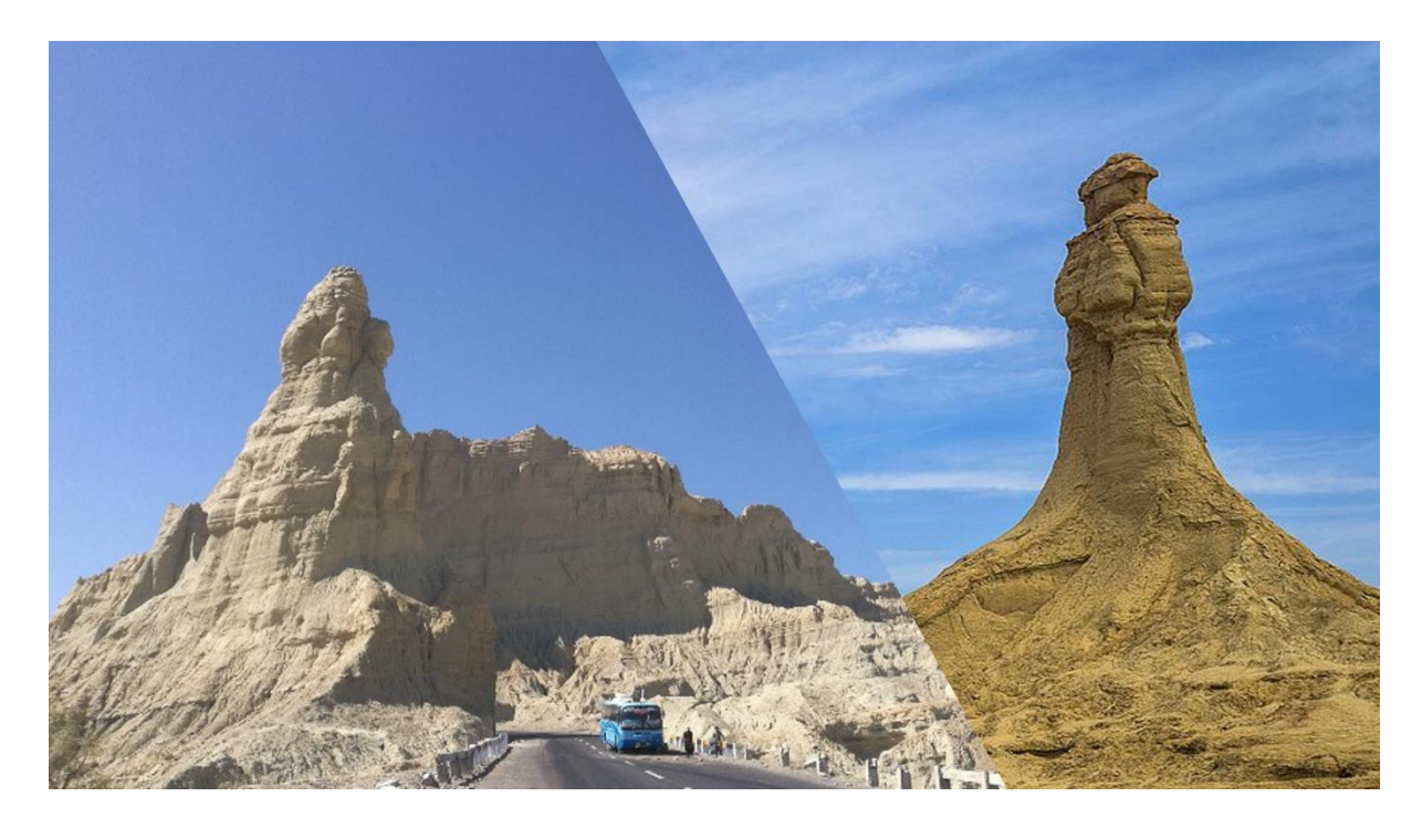
Figure 9: (On the right) The Princess of Hope is the sculpture, invented in the Hingol National Park. The unique name was specified by Hollywood actress Angelina Jolie on her visit to the region. On the left, a beautiful view of mountains on the way to Gwadar.