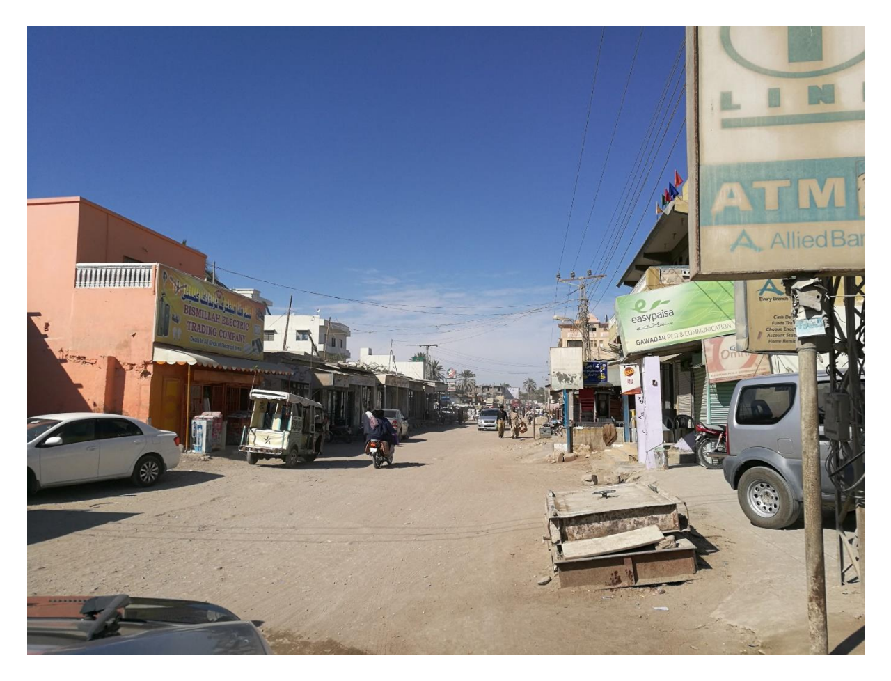
Figure 5: The situation of roads in central city area of Gwadar.

It has been observed during the course of field study, the situation of infrastructure in Gwadar is not very different from the basic facilities. A small businessman said, "the vehicle movement has increased in the city due the CPEC developments. People from Pakistan and overseas are coming to city in large number every day. Furthermore, all the transportation to Gwadar port is through these small roads which are even insufficient for the residents of Gwadar. Due to lack of repair and maintenance, and heavy traffic all the roads structure has obsolete." Figure 4 shows the situation of roads in Gwadar.