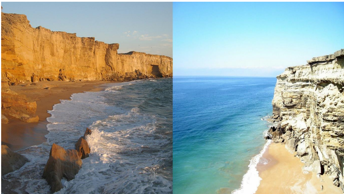
Figure 10: Two beautiful views of virgin beaches in Gwadar. Source - Youlinmagazine (left), Astola Island (right)

There antique handmade boats can be used to sail tourist and they work as drivers, tourist guides and in other tourism related businesses such as hotels and resorts. Pak-Iran boarder in “Kech” (near Gwadar) also has a potential to increase tourism in Gwadar. Around millions of