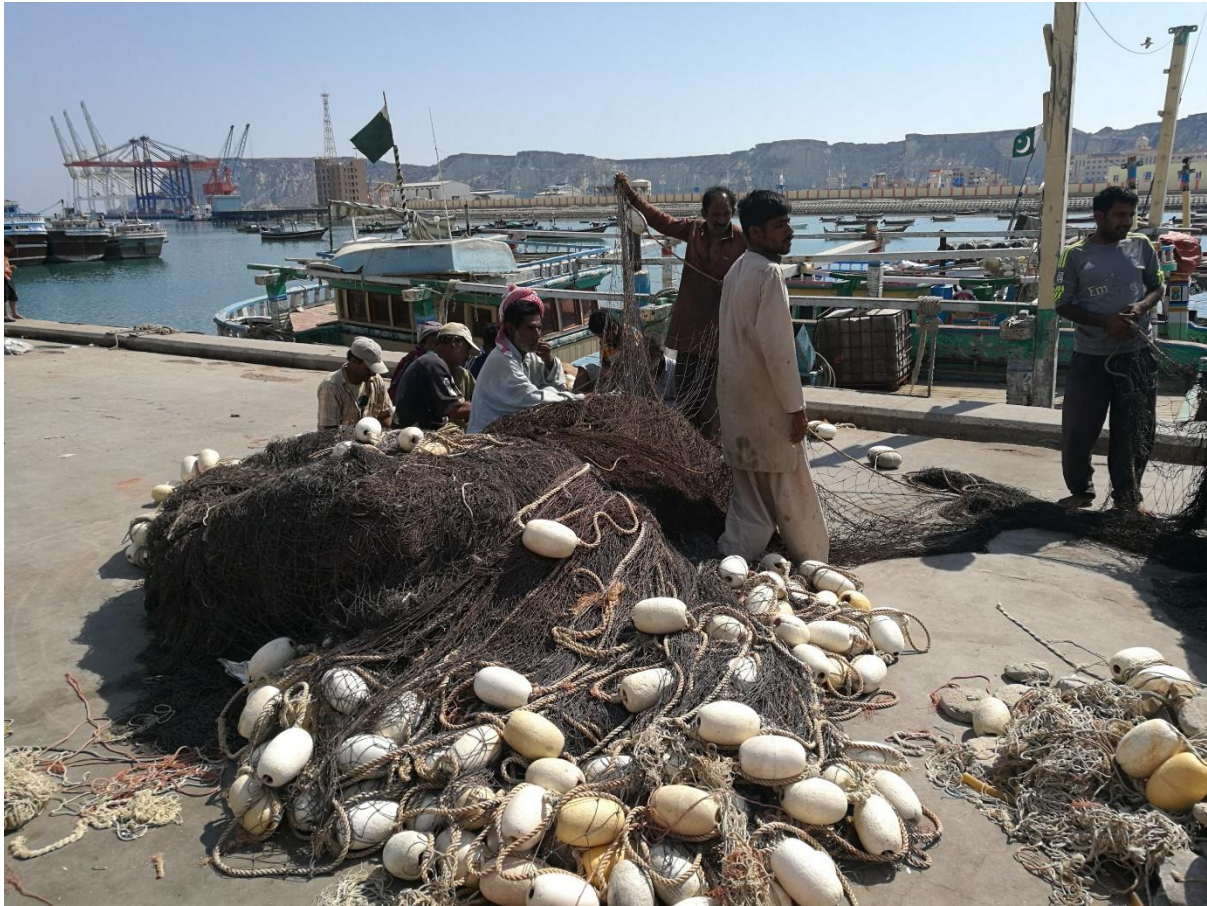
Figure 2: The fishermen sitting at harbour fixing their fishing nets. New Gwadar port can be seen in the background.

Regarding local business in Gwadar, it has been observed during the course of field study that there two main types of local businesses sea-food factories and boat making workshops, providing livelihood to number of people in Gwadar. Other local small businesses are restaurants, general stores and oil depots. The people associated with local businesses and their workers also participated in the interviews. The responses gathered were