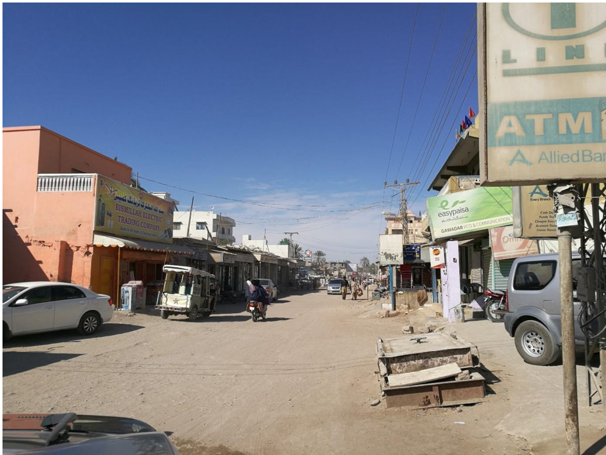
Figure 5: The situation of roads in central city area of Gwadar.

It has been observed during the course of field study, the situation of infrastructure in Gwadar is not very different from the basic facilities. A small businessman said, “the vehicle movement has increased in the city due the CPEC developments. People from Pakistan and overseas are coming to city in large number every day. Furthermore, all the transportation to Gwadar port is through these small roads which are even insufficient for the residents of Gwadar. Due to lack of repair and maintenance, and heavy traffic all the roads structure has obsolete.” Figure 4 shows the situation of roads in Gwadar.