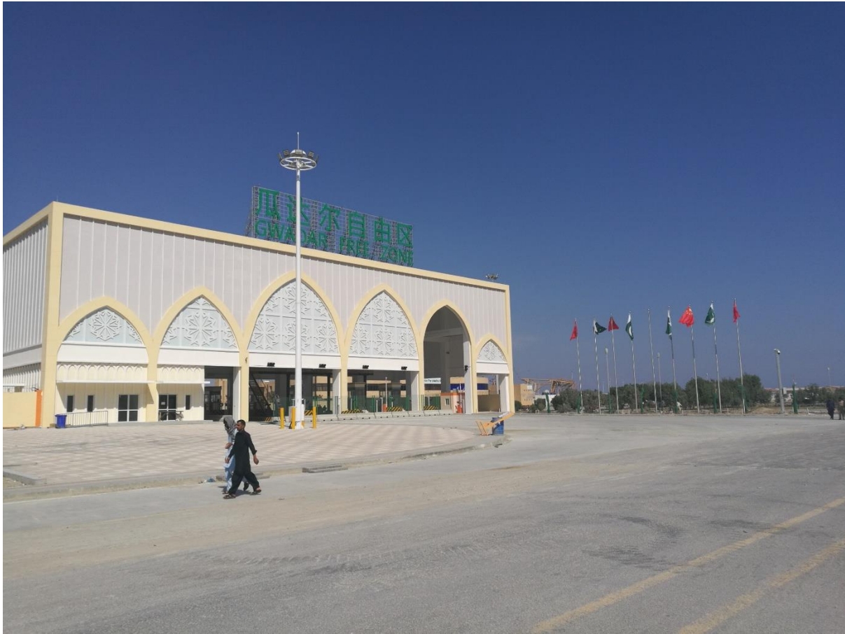
Figure 7 : Gwadar Free Zone Entrance