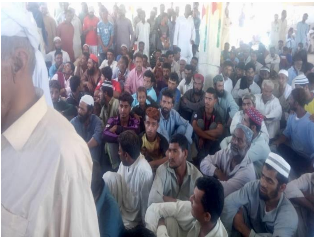
Figure 6: The fisherfolk of Gwadar are sitting in protest against forced evictions without any prior notice.

A fisherman protestor says, “we were not informed about any alternative route to access the sea. How we will access to sea and earn livelihood to feed our families?”