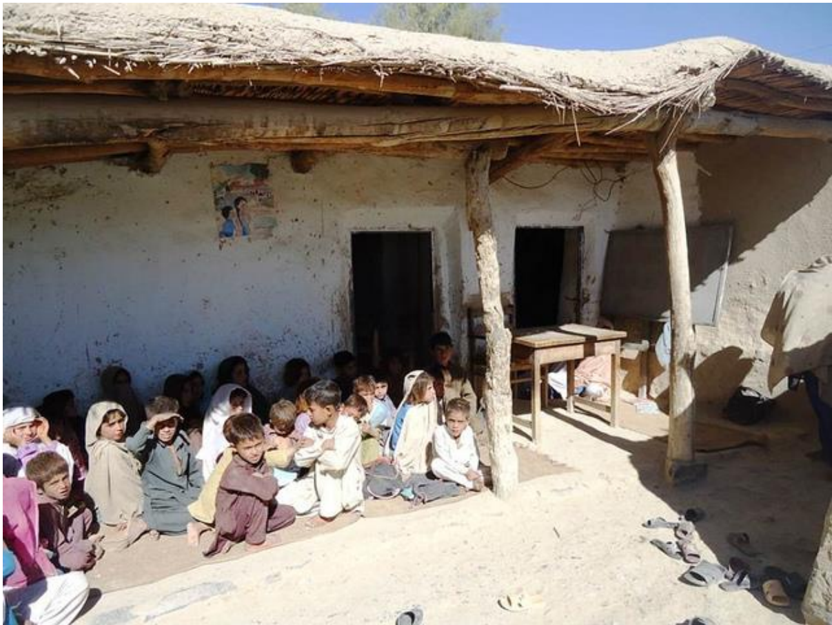
Figure 4: A single-classroom school without any infrastructure in Gwadar.

The educational institutes of Gwadar lack infrastructure facilities as shown in figure 3.