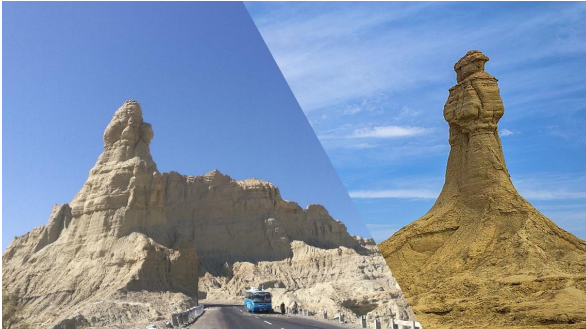
Figure 9: (On the right) The Princess of Hope is the sculpture, invented in the Hingol National Park. The unique name was specified by Hollywood actress Angelina Jolie on her visit to the region. Source: Princess of Hope . On the left, a beautiful view of mountains on the way to Gwadar.