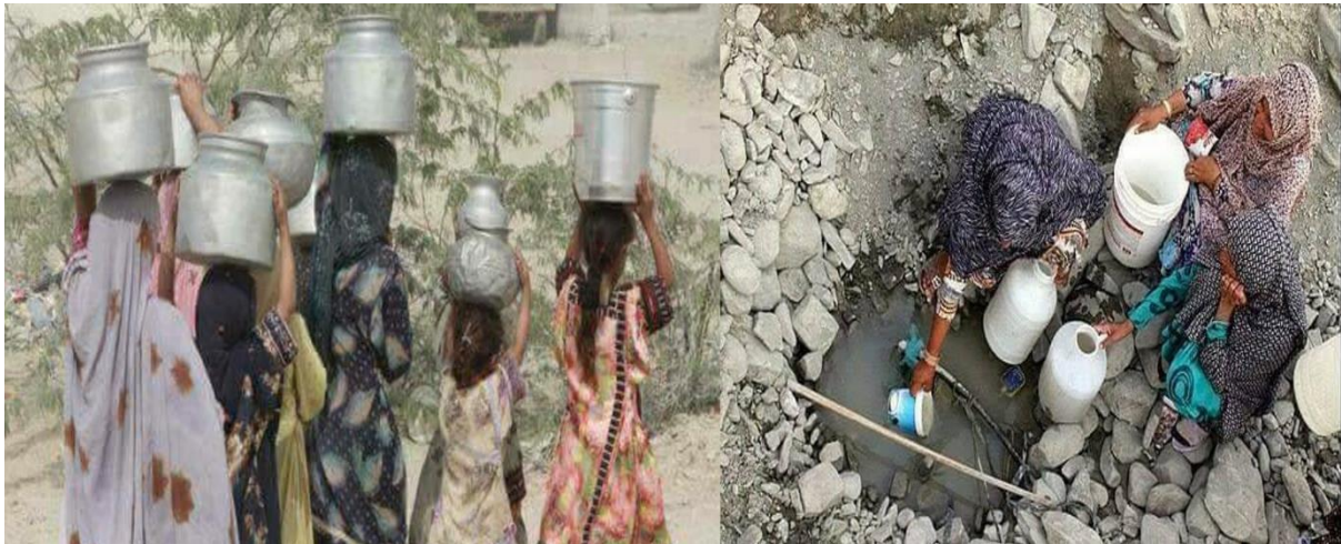
Figure 3: Shows the water scarcity in Gwadar. The women (at right side) are filling the water pots while the young girls (at the left side) are transporting water to their homes.

One respondent mentioned that “The one and only source of water in Gwadar ‘Ankara Kaur Dam’ has been dried because of no rainfall in Gwadar for the past few years. The government is providing water to the inhabitants of Gwadar from ‘Meerani Dam’ through water tankers. The Meerani Dam is located 150 kilometres from Gwadar. The price of water tanker is PKR 20,000 per tanker which is not affordable for the poor fisherfolk of Gwadar.”