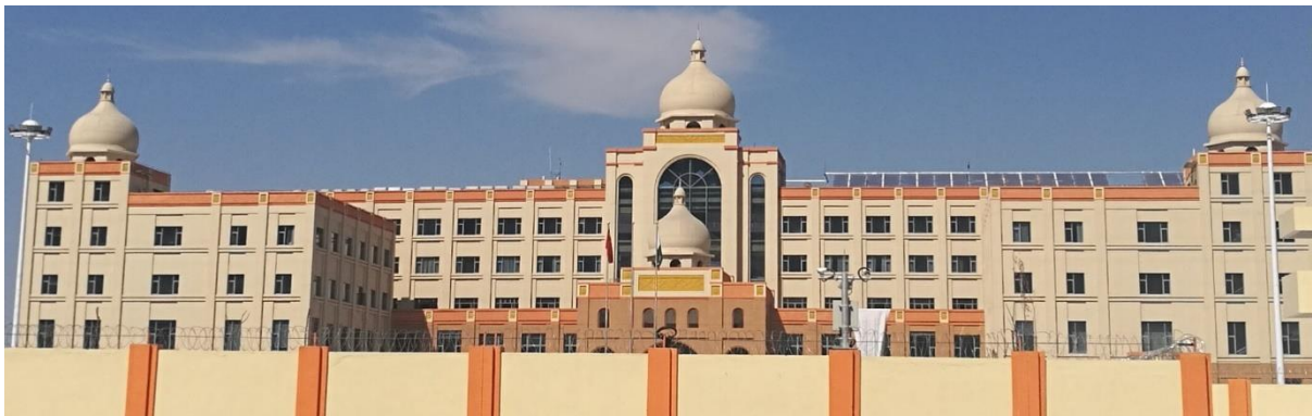
Figure 8 : Gwadar Free Zone

To achieve the modern society through development, there are several risks involve, mentioned by Ulrich Beck in risk society theory. The study analysed the situation and investigated the fisherfolk of Gwadar to find out the risks involved. The study established that fisherfolk of Gwadar are struggling and their life is getting miserable every other day due to risk associated with CPEC developments. The livelihood of fisherfolk of Gwadar is at higher risk. Since 2006,