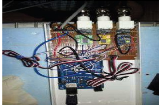
Figure 2. Top view: System Prototype

50 second values have shown. Similarly, Fig. 3(b) represents Dissolved Oxygen with value 9.58 mg/lit with error of \pm 0.2 mg/lit, and Fig. 3(c) Oxygen Reduction Potential with 250 mV and response time is 95% in 1 second. Fig. 3(d) Temperature.