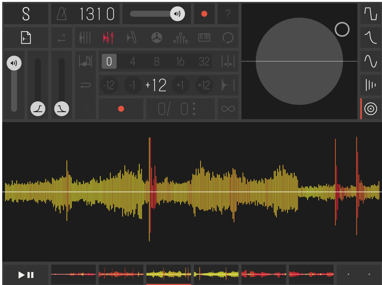
Picture: Samplr with the playback mode Looper.

My instrument is an audio sampler in a software format. I use an app for the Apple iPad called Samplr. It is a fully operational sampling tool with different playback options. It's signal flow works like any other recording tool, but it has other tools for playback which makes it unique.