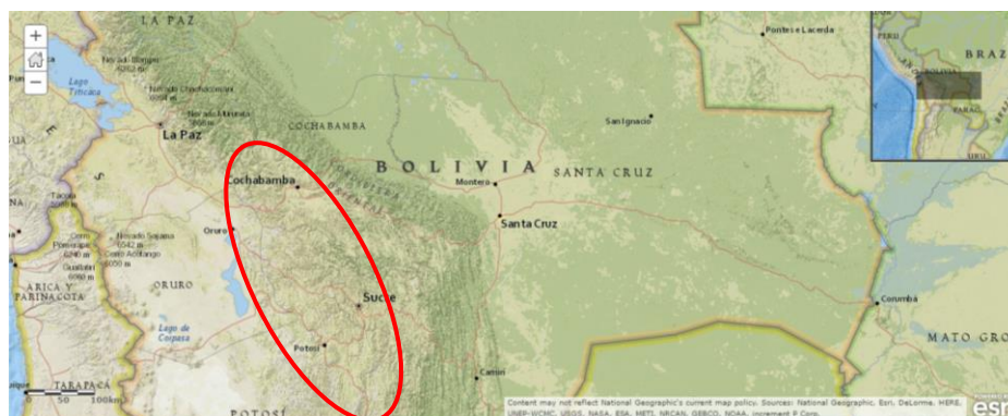
Figure 1. Bolivian Andean and Inter-Andean Valleys