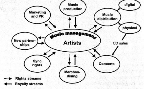
Figure 1.3 The new value-added network

For any artists, the revenue stream has always been important to keep the career going. The income of money is the lifeline for the artists in more than upholding the career, but also earn enough for a living. During the millennium change, the outcome of the digital interruption influenced the revenue streams that put the music industry in an economic crisis. As the value-added network changed (Wikström, DeFillippi, 2016, s. 16.) several new forms of revenue sources were introduced. For the artists, the main revenue sources were record sales. in addition to that there was some income drawn from collecting societies that licensed music for different use. This could be licenses like synchronization rights or mechanical rights. During the digitalization, this got a sudden turn and changed the value-added network and then also the revenue sources for the artist. Tschmuck explains the fundamental changes in the different sectors of the new value-added network (Figure 1.3), that I briefly will go through in this paragraph.