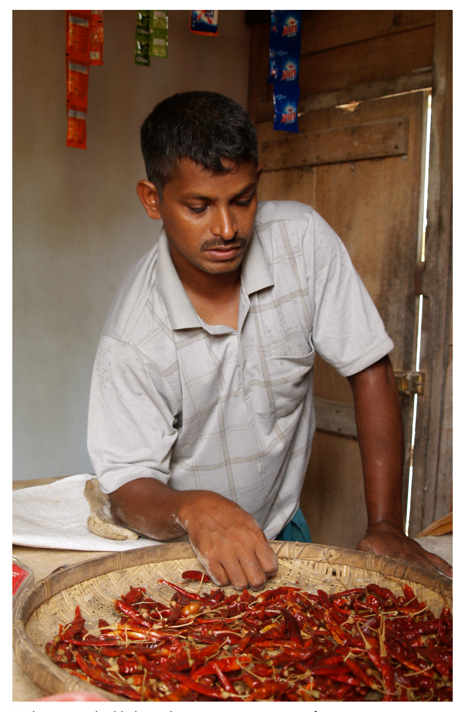
With support, disabled people can participate in microfinance