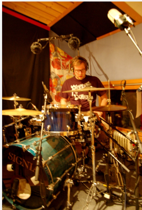
Photo above: the control room (sound engineer and producer) Photo below: drum booth (drummer)