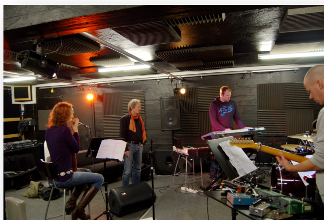
Artist, producer, keyboardist and guitarist in the rehearsal room (the bass player and drummer, present at the time, do not appear in this photo)

The ethnographic settings are three separate locations in Oslo: 1) A rehearsal studio, 2) Musikkloftet recording studio, and 3) Fersk Lyd recording studio. The rehearsal studio is a rented ensemble room with amplified live sound and monitors. This is where the artist and the band rehearse and discuss the material for the album. Sometimes the producer joins the musicians and contributes his ideas, but, at this stage, there is no need for the sound engineers.