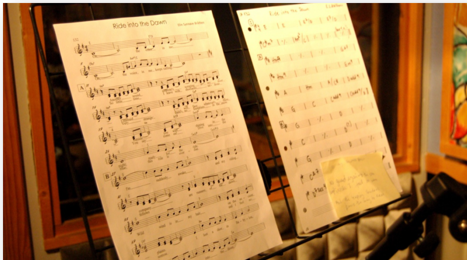
Two different versions of the music sheet for track no. 3

interpretative scope by looking into the implied meanings of a flux of metaphoric linguistic expressions. In other words, this project goes beyond the denotative meaning of a word you can look up in a dictionary. We could almost talk about this layer of codes as a figurative “meta-language” that linguistically follows the rules in the way that words are inflected, phrases are structured and sentences are built, but with its own specific set of meanings and connotations determined by a small group of people; in this case the participants in the current album-recording. This product of figurative creativity between “insiders” generates a system of verbal codes with a certain group-specific meaning. This task touches upon semiotics 22 insofar as it shows the production of meaning from a relationship between sign-systems (linguistic and non-linguistic); “musicspeak” is sometimes linked to the non-linguistic sign-system of “the music sheet” (or “music chart”) – music denoted by chords, notes, expression symbols, etc.; basic information handed out to session musicians. However, I have not made semiotics an issue requiring in-depth source studies because, linguistically, the research task revolves around what the participants say.