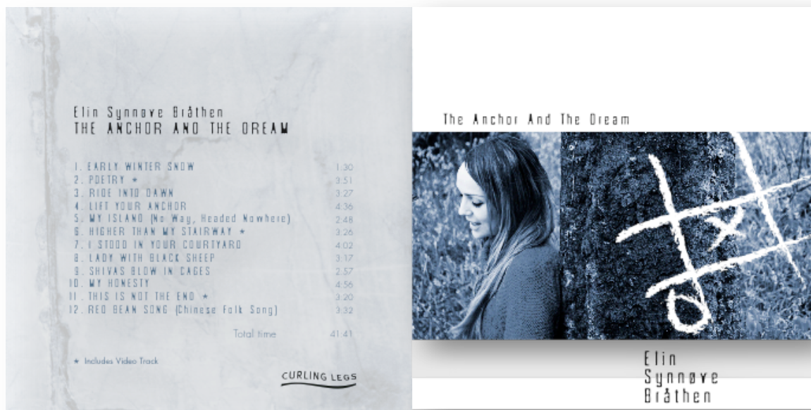
Cover-image (back & front) of the album The Anchor and the Dream

As an indication of the genre of the album I quote from some of the published reviews. A London music critic, writing in the newspaper The Irish World , says: "...this wonderful collection of songs, mixing as it does elements of Pop, Jazz, Rock, Celtic and World music." 29 Another reviewer wrote: "The vocalist and song-smith (...) has developed the music into a unique mix of pop, rock, jazz and world music." 30 A Norwegian online magazine reads: "It is not purely a jazz-album, but more a mix of different styles. (...) Vocally she reminds me of Kate Bush and Tori Amos (...)." 31 Music critic for the respected Norwegian music magazine Puls , Arild Rønsen, calls it: "... a tasteful mix of jazz and pop." 32 These are just a handful of the reviews published in foreign and Norwegian magazines and newspapers. Some highlight the Celtic or World inspiration and others label it "pop music with a jazz flavour"; however, all agree that my music represents a "mixture of popular music genres."