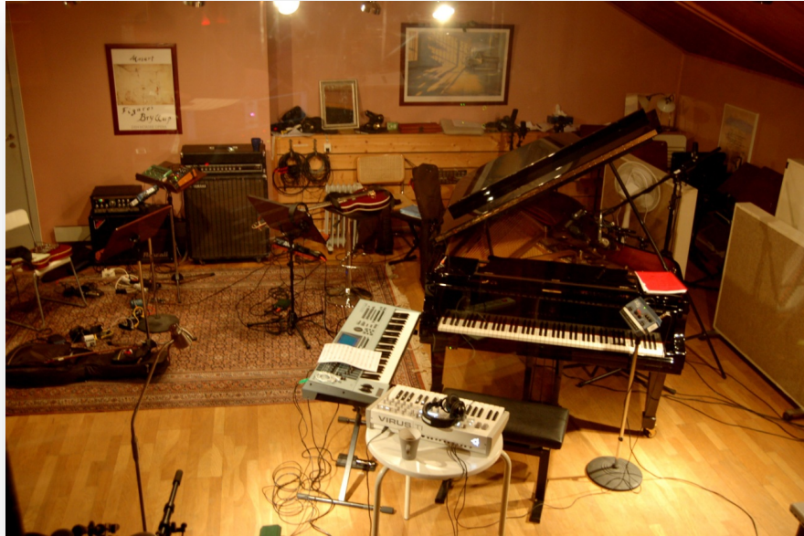
Main recording room (grand piano, keyboards, bass, guitar)

The rest of the time is spent in two different professional recording studios. The first session was recorded at Musikkloftet Studio, and the second at Fersk Lyd Studio. The photographs below were taken at Musikkloftet Studio: