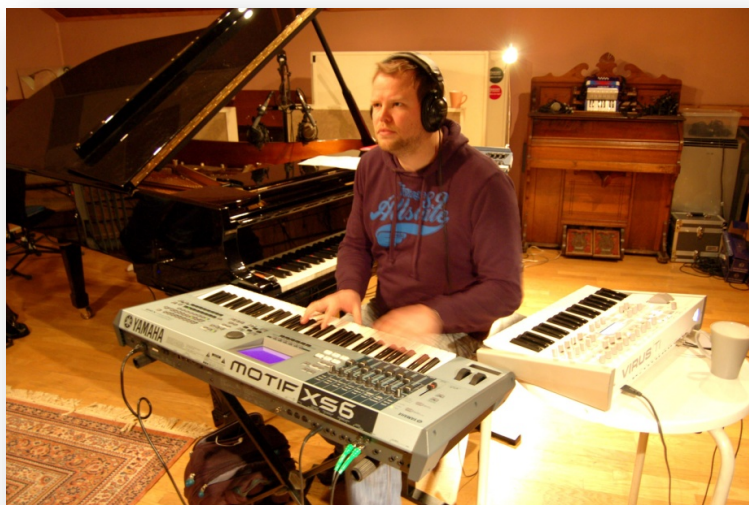
Main recording room (above: guitarist and bass player, below: keyboardist)