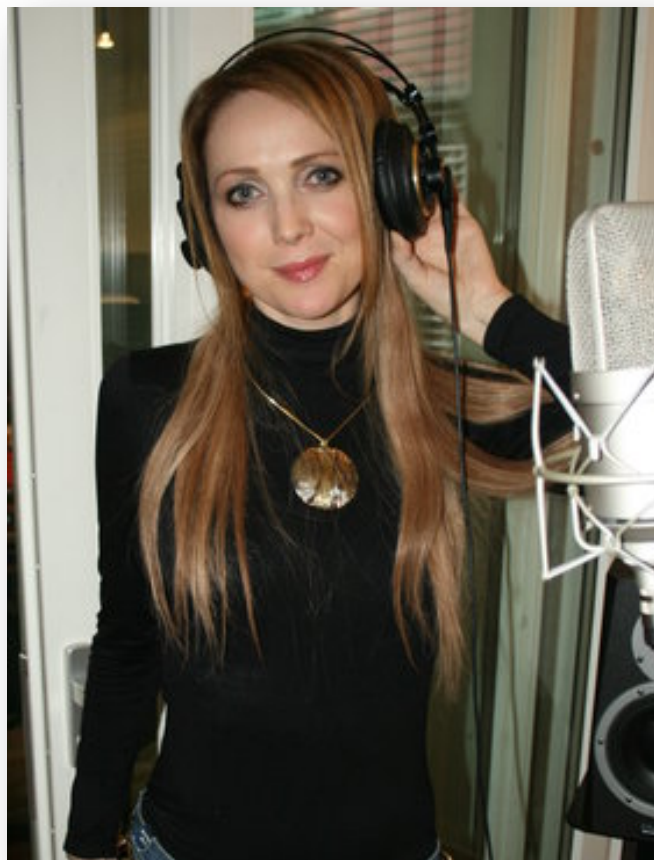
Artist in vocal booth (Fersk Lyd AS)

Here again, the vocalist was placed in a separate and sound-proof booth, recording the vocals through a live (open) studio microphone, wearing headphones to hear playbacks of the tracks, to monitor the live vocal sound, and to communicate with the producer and sound engineer in the control room. Communication between the vocal booth and the control room is regulated by a function called “talkback.” The vocalist can only speak to the producer and sound engineer if this function is activated. If the “talkback button” is active the vocalist can hear what the producer and sound engineer are saying but cannot be heard by them, and is therefore unable to interact with them, something which obviously affects the total dialogue-structure.