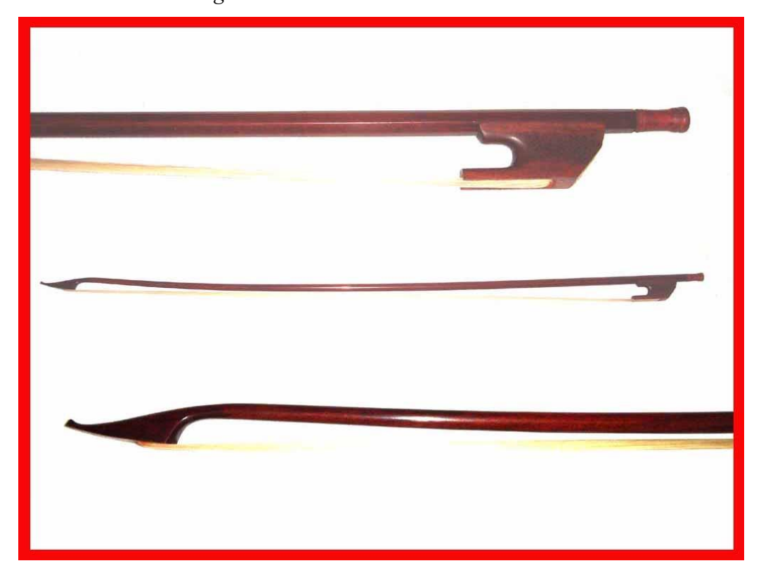
The bow and the strings

Baroque bow plays a big part in performing. The convex shape of the bow allows it to have a bit different approach to the string by huging it and also it is perfect for the articulation of shorter notes. In general the bow should be held a bit further from the frog by keeping the middle finger in contact with the bow hair.