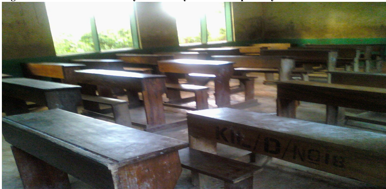
Figure 12: Desks constructed by community at Kilakala primary school

The parents/ community contribute either in cash or in kind (labour) to the construction of the desks and tables. For example, the community at Mindu primary school they used to go to the forest and cut wood and construct the desk in their own cost. The community contributes Tsh. 1000 for each household to get the money to pay for carpenters who constructed that desk/chair. Tsh. 1000 is equal to $ 1 dollar in which the people can afford to pay compare to the cost of construction of classroom or houses. The community at Kilakala primary school contributes money in construction desks and tables. Each parent has to pay Tsh 15,000 ($15 dollars) yearly as the contribution for the school development. The school takes 30 percent of the money collected for the construction of desks, table and chairs. The reasons for the people at Kilakala to use money as the way of contribution explained in other activities explain earlier.