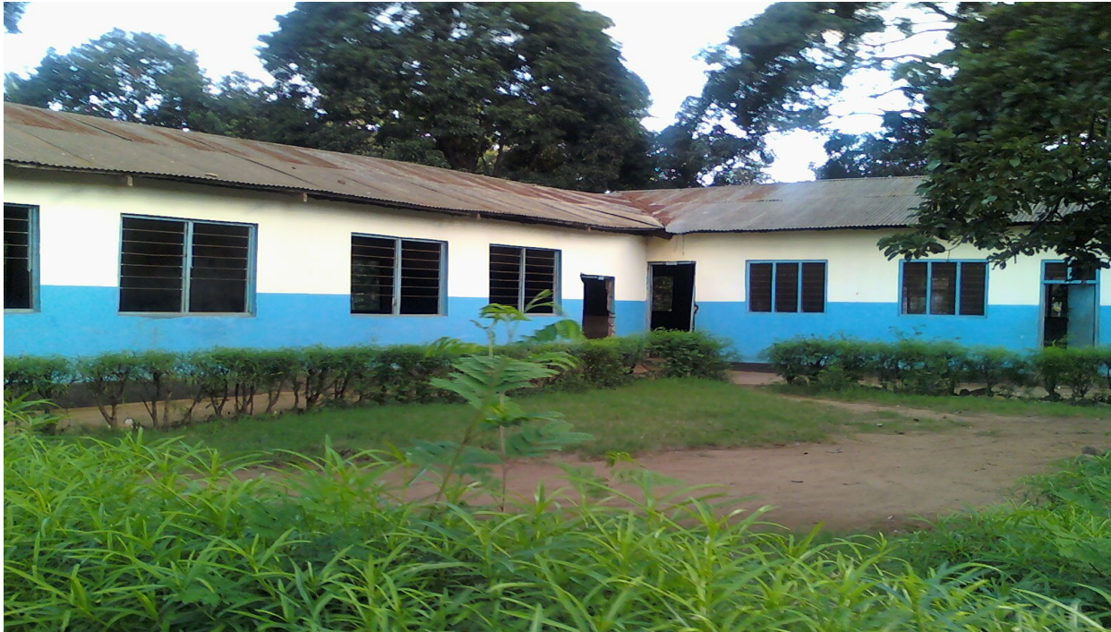
Figure 2: Kilakala Primary School