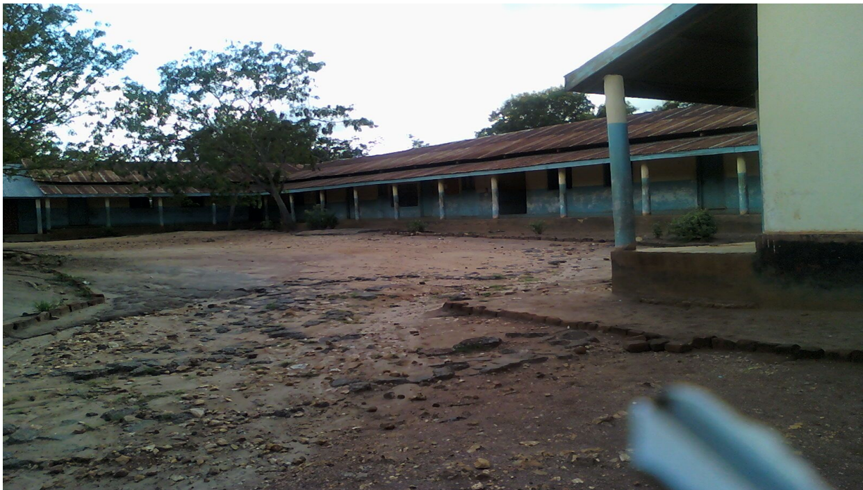
Figure 3: Mindu Primary School – Classrooms