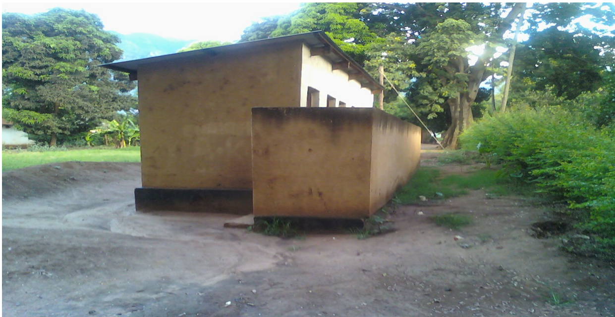
Figure 11: Toilets built by community at Kilakala Primary School