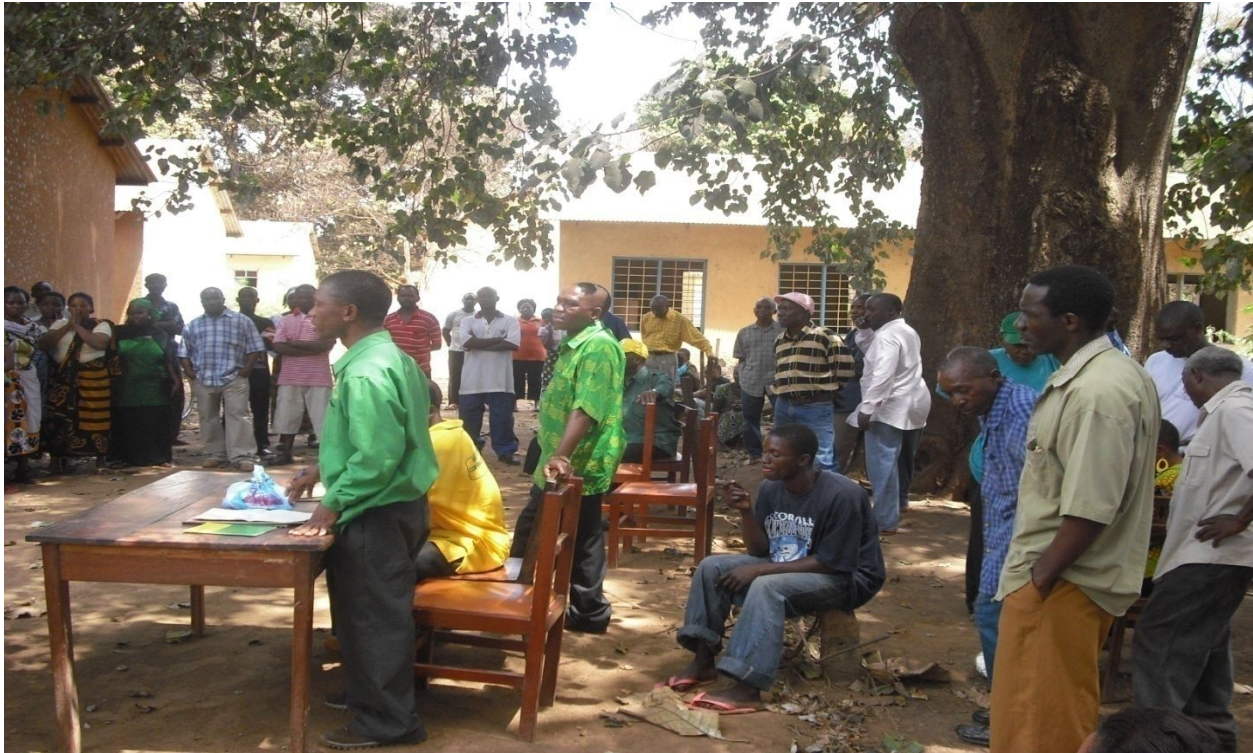
Figure 13: the local people participation in the General meeting at Kilakala primary school.