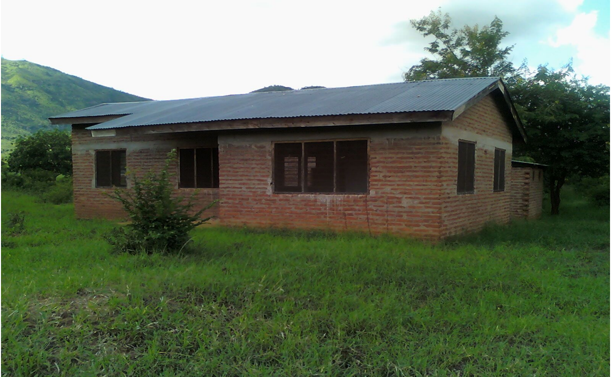
Figure 9: One of the Teacher's Houses built by the community at Mindu Primary School in 2002