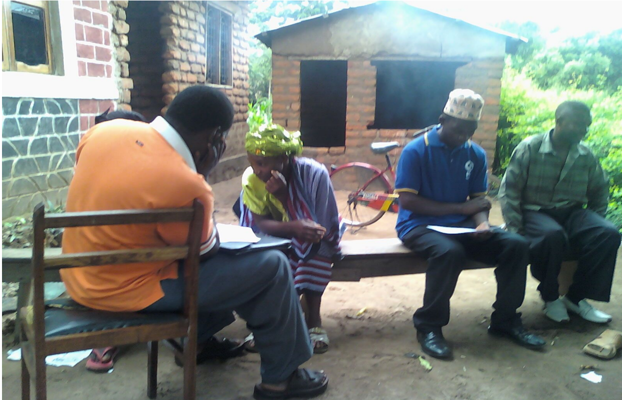
Figure 5: The researcher conduct unstructured interview with local people in the community at Mindu area.

Generally, the interview method provides an excellent opportunity to probe and explore questions. According to Rwegoshora (2006:128) recommended that this method is very useful because it help the researcher to know about the subject matter at first hand. During the interview processes the respondents/interviewees were free to answer the questions as they wishes and given chance to ask questions for clarification. I prepared the interview guide to ensure that I cover the targeted areas during the interview. The most disadvantage of this method is that sometime, the respondents provide irrelevant information for the study and time consuming.