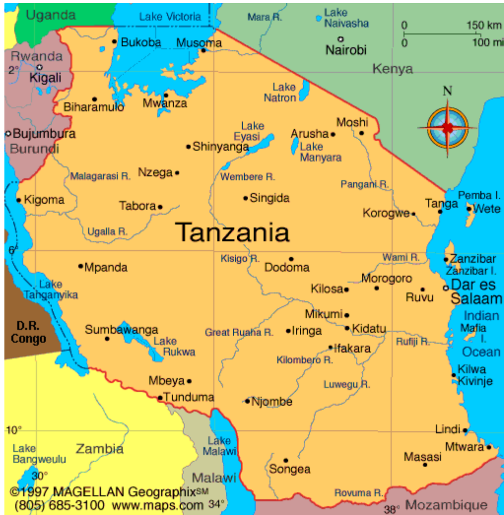
Figure 1: Map of United Republic of Tanzania