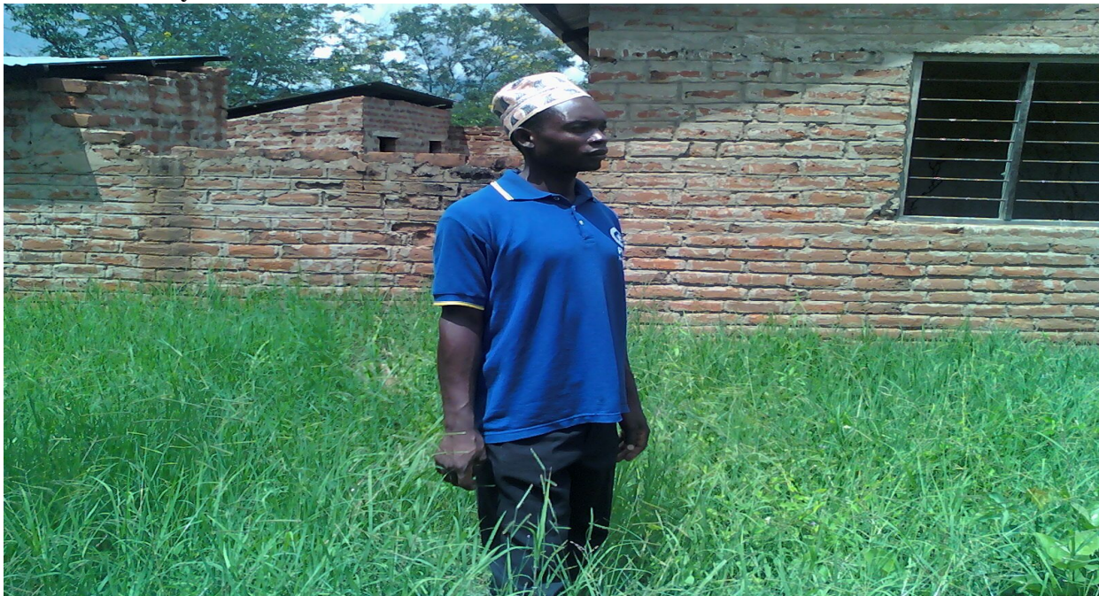
Figure 6: One of the teacher's houses which the community failed to complete since 2004 at Mindu Primary School.

The statement above shows to extent the community does not support the development of their school. The head teacher stated that the program of building teacher's houses stated since 2004 but still to this moment is not completed. He argued that people are not committed with their decision when it comes to the implementation. Example, the community in 2006, decided to contribute Tsh. 2000 ($ 2 dollars) from each household for building toilets in teacher's houses but up to this moment, only 24 households contribute that amount. The Mindu Ward has more than 300 households; therefore, only 8 percent of the households contribute to what they decided.