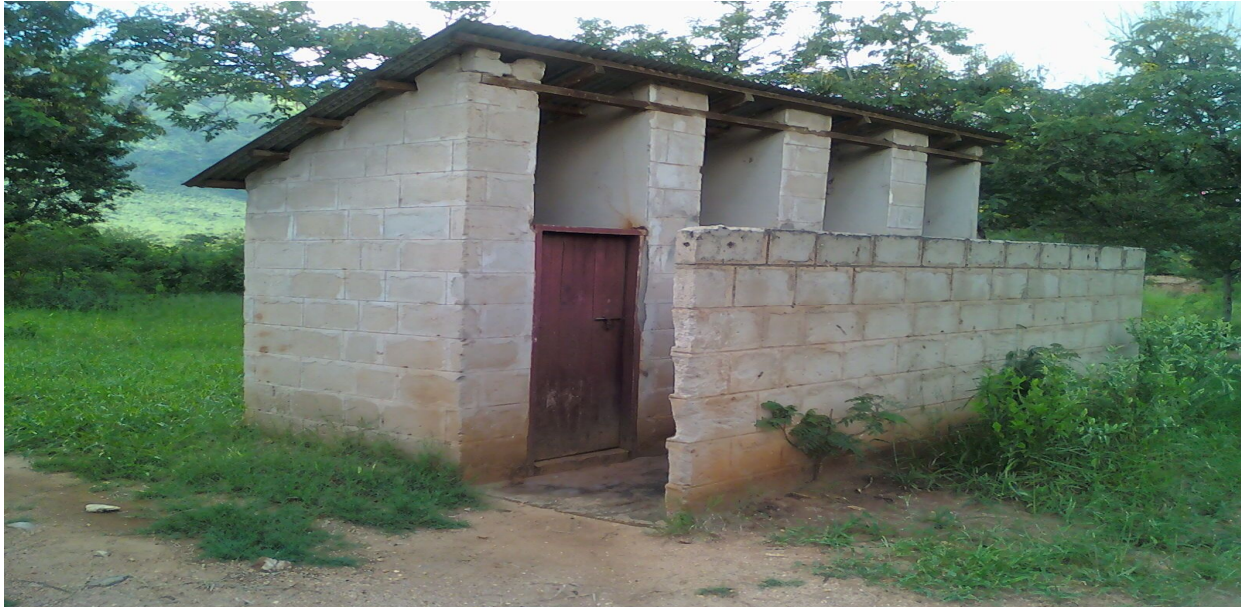
Figure 10: The toilets built through community participation at Mindu Primary School

chairperson of school why they do not constructed water taps for the children at school. They responded that, the majority of the population in the community use water from the dam for home consumption. They argued that there is no problem for their children to collect the water from the dam and disagreed to contribute to construct modern water taps.