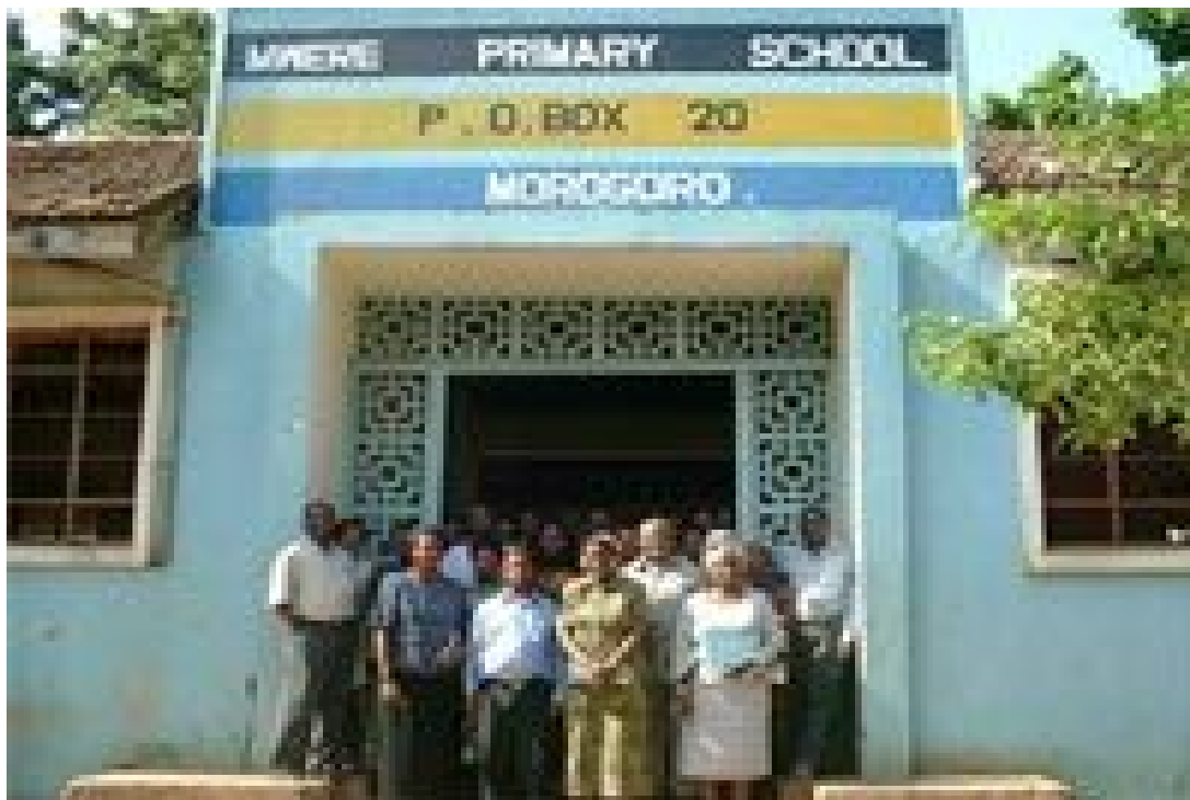
Figure 4: The training for primary teachers organised by PEDP, Morogoro

Moreover, the Primary Education Development Plan (PEDP) brought positive changes in development of primary education in Tanzania especially in rural communities. The Minister of Education and Vocational Training, Margaret Sitta (2007) explained in details on the achievement of PEDP in the country. The minister argued that PEDP increase the Net Enrolment Rate (NER) from 80.7% in 2002 to 96.1% in 2006, Gross Enrolment Rate (GER) form 98.6 in 2002 to 112% in 2006, pupils pass rate increases from 27.1% in 2002 to 62% in 2006. The transition to from primary to secondary school increases from 21.7% in 2002 to 49.3 in 2006. Therefore, the Primary Education Development Plan contributes a lot to the primary education development in Tanzania.