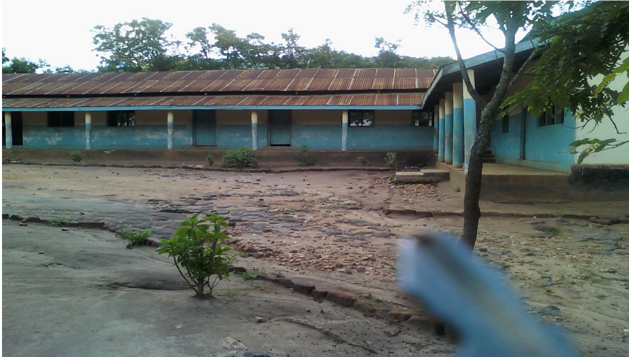
Figure 7: The classroom built by government in 1970s at Mindu Primary School