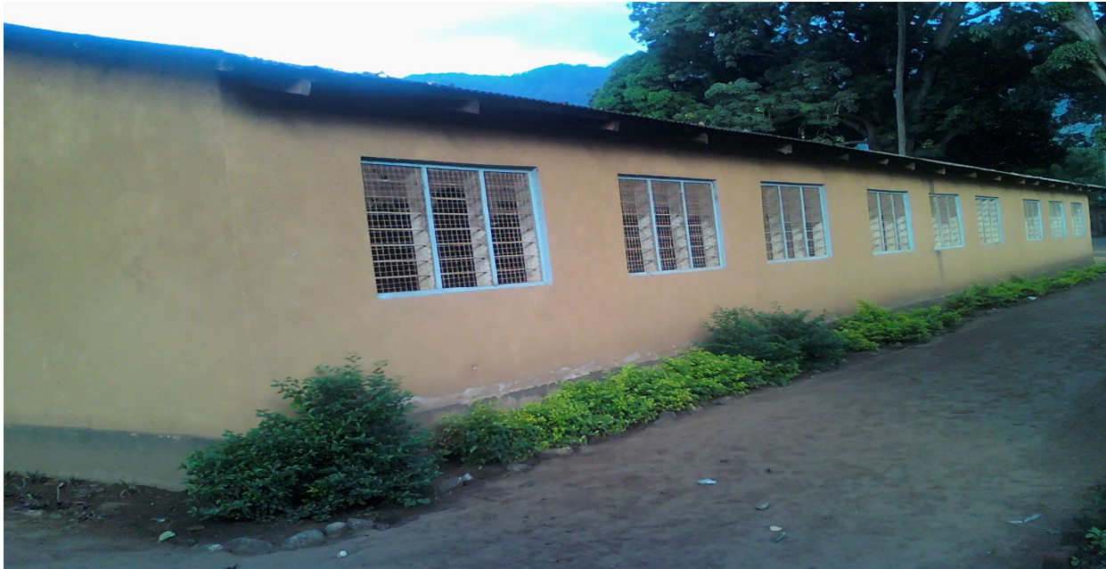
Figure 8: The new classroom built through community participation in 2002 at Mindu Primary School